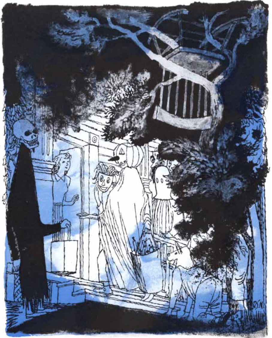
ON HALLOWEEN IN THE U. S. today children beg for candy and other edibles. This custom possibly originated with the procession of Muck Olla.