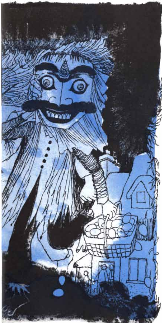
cession stopped at farms and begged for butter, eggs and other produce.

The old rites nevertheless survived in attenuated form. In medieval Europe there was a weird survival of the Druid burnings: on Halloween black cats were put into wicker cages and burned alive.