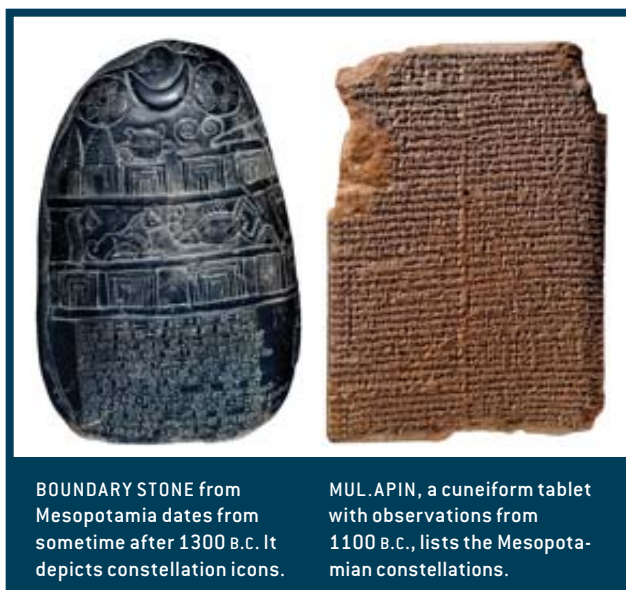
BOUNDARY STONE from Mesopotamia dates from sometime after 1300 B.C. It depicts constellation icons.

The origins of the Greek constellations from a patchwork of sources superimposed on the sky lie so far in the past that evidence is sketchy, and we must acknowledge that the story will have significant gaps and that some points can only be reasonable speculation. But the basic outline is clear, and it shows us how knowledge is transferred across time and space as changing parts of culture. Constellations provide a unique way of gaining insight into a culture (different from, say, pottery styles) because they consider an intellectual aspect of prehistoric society, something that is hard to discern from more typical archaeological sources. Furthermore, the sequence in the uses to which societies put constellations tracks the way one aspect of astronomy was transformed into a modern science. The sequence moves from religious to folk to practical to scientific usages, a consistent trend toward decreasing spirituality and increasing quantification. And yet today as in the past, the tales of our grandparents continue to link generations and cultures. ■